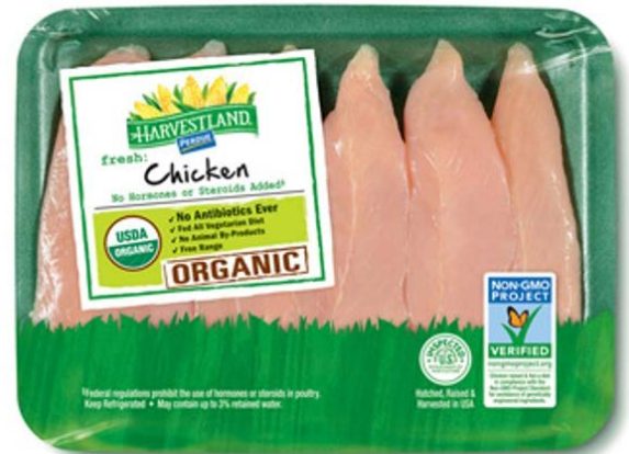
Breast Tenders Code: HV68936 Packed 8 per 8lb case SRP: $11.29 lb