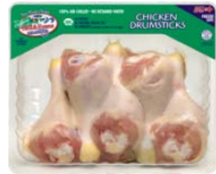
Drumsticks Code: BV3184K Packed 10 per 11-18lb case SRP: $3.89 lb