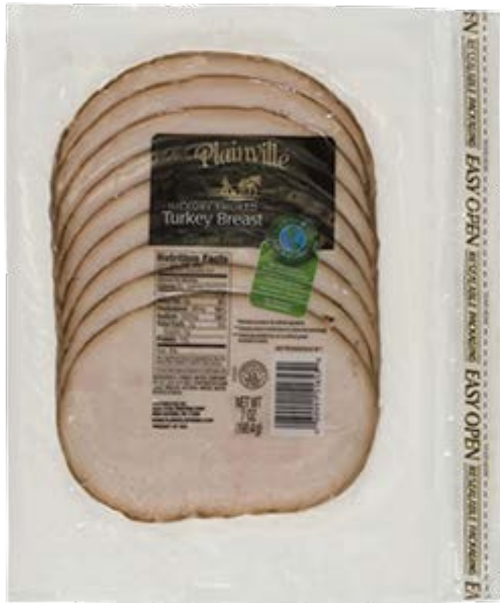
Pre-Sliced Hickory Smoked Turkey Breast Code: PV3757 Packed 8 / 6oz UPC: 8-99916-26512-8 SRP: $4.99 ea