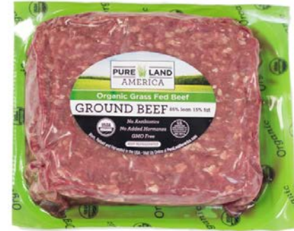
85% Ground Beef Brick Code: AO3537 Packed 12 / 16oz UPC: 7-93573-04180-7 SRP: $9.99 ea