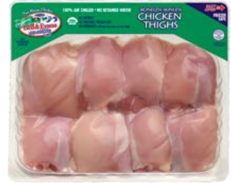
Boneless, Skinless Thighs Code: BV3177K Packed 10 per 11-18lb case SRP: $6.19 lb