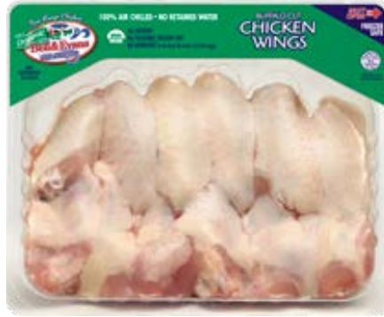
Cut Buffalo Wings Code: BV3165K Packed 10 per 11-18lb case SRP: $4.89 ea