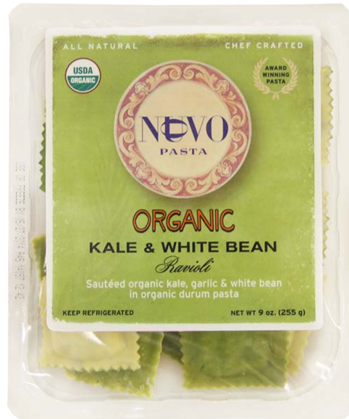
Kale with White Bean Ravioli Code: NO5970 Packed 6 / 9oz UPC: 0-80051-59709-4 SRP: $5.99 ea