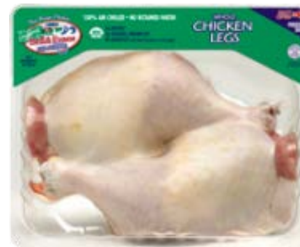
Whole Legs Code: BV3183K Packed 10 per 11-18lb case SRP: $4.99 lb