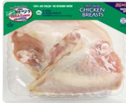
Split Breast Code: BV3182K Packed 10 per 11-18lb case SRP: $8.09 lb