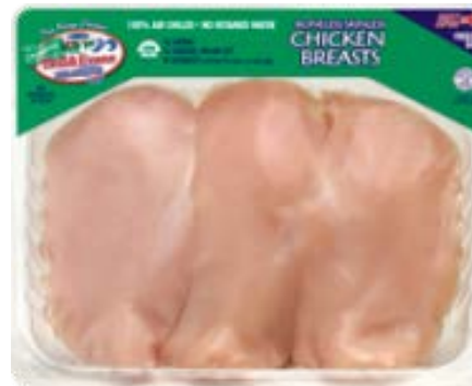
Boneless, Skinless Split Breast Code: BV3189K Packed 10 per 11-18lb case SRP: $12.49 lb