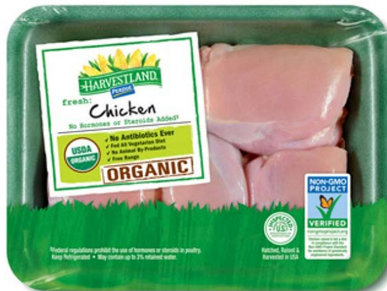
Boneless Skinless Thighs Code: HV68865 Packed 8 per 12.8lb case SRP: $7.19 lb