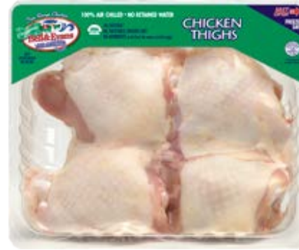
Thighs Code: BV3170K Packed 10 per 11-18lb case SRP: $4.99 lb