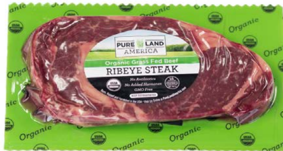
Ribeye Steak Code: AO1121 Packed 8 / 10oz UPC: 6-58533-13726-9 SRP: $18.39 ea