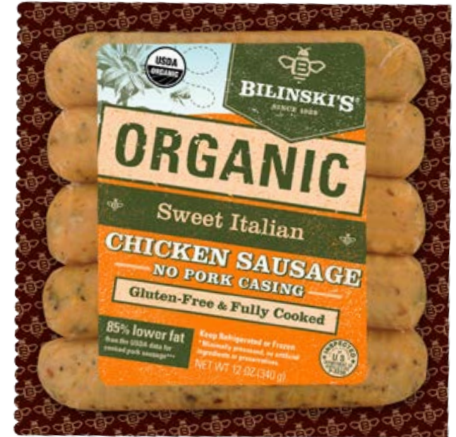
Sweet Italian Sausage Code: BI7859 Packed 8 / 12oz UPC: 0-71728-07115-3 SRP: $7.99 ea