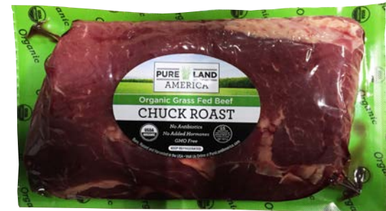
Chuck Pot Roast Code: AO3525 Packed 12lb case SRP: $12.49lb