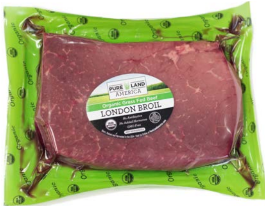
London Broil Code: AO3399 Packed 6 / 24oz UPC: 6-58533-13399-5 SRP: $22.99 ea