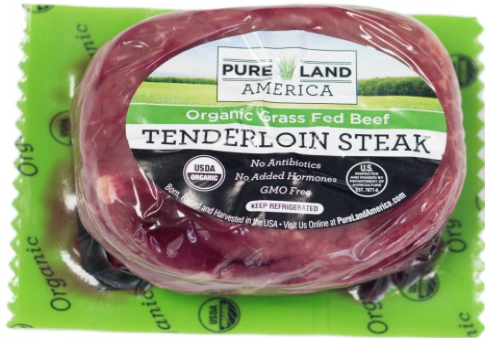
Tenderloin Steak Code: AO1892 Packed 10 / 8oz UPC: 6-5833-13729-0 SRP: $19.99 ea