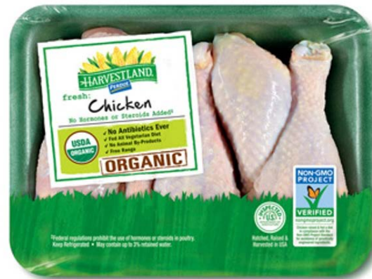
Drumsticks Code: HV68808 Packed 8 per 14lb case SRP: $3.39 lb