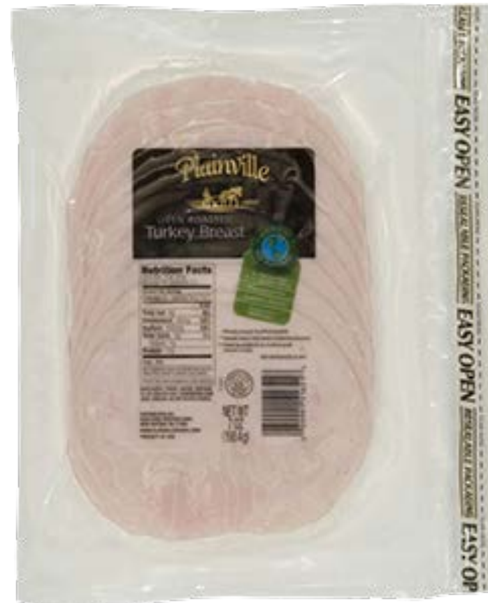
Pre-Sliced Oven Roasted Turkey Breast Code: PV3758 Packed 8 / 6oz UPC: 8-99916-26505-0 SRP: $4.99 ea