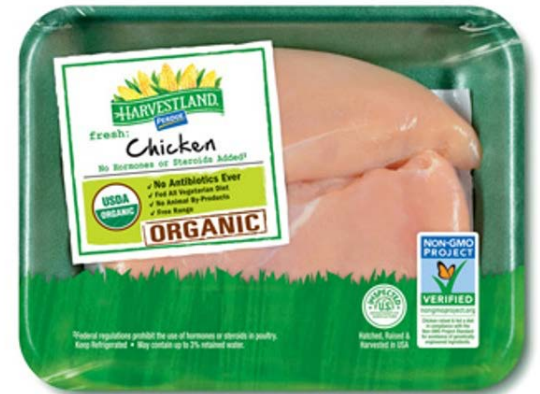
Boneless Skinless Breast Code: HV68829 Packed 8 per 9.4lb case SRP: $10.49 lb