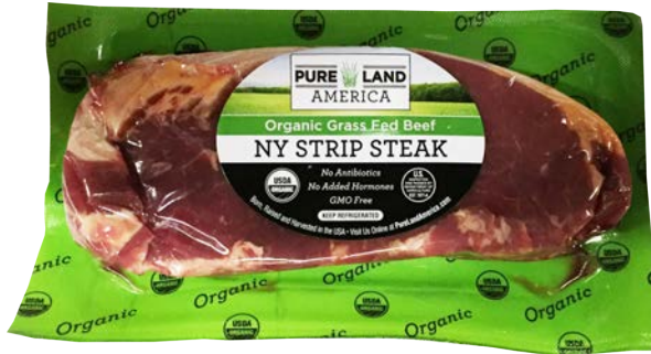
NY Strip Steak Code: AO4277 Packed 10 / 8oz UPC: 6-58533-13725-2 SRP: $16.49 ea