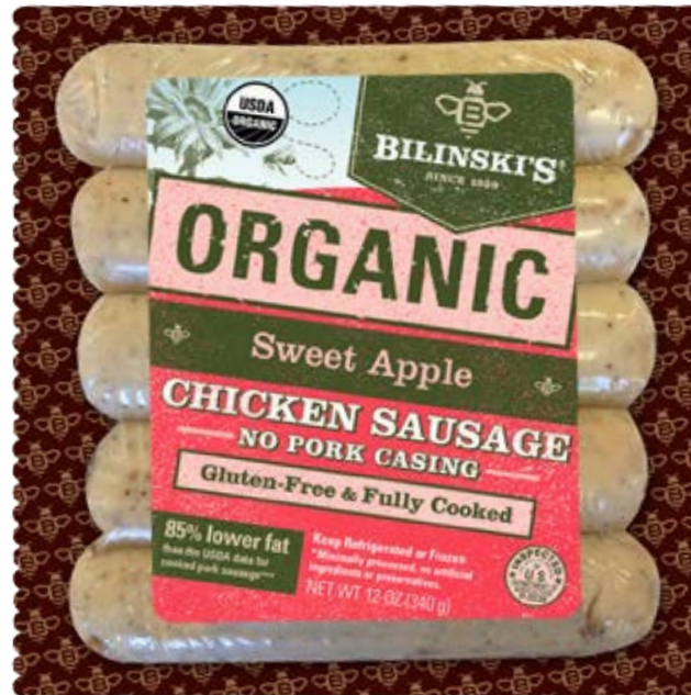
Sweet Apple Chicken Sausage Code: BI7698 Packed 8 / 12oz UPC: 0-71728-07110-8 SRP: $7.99 ea