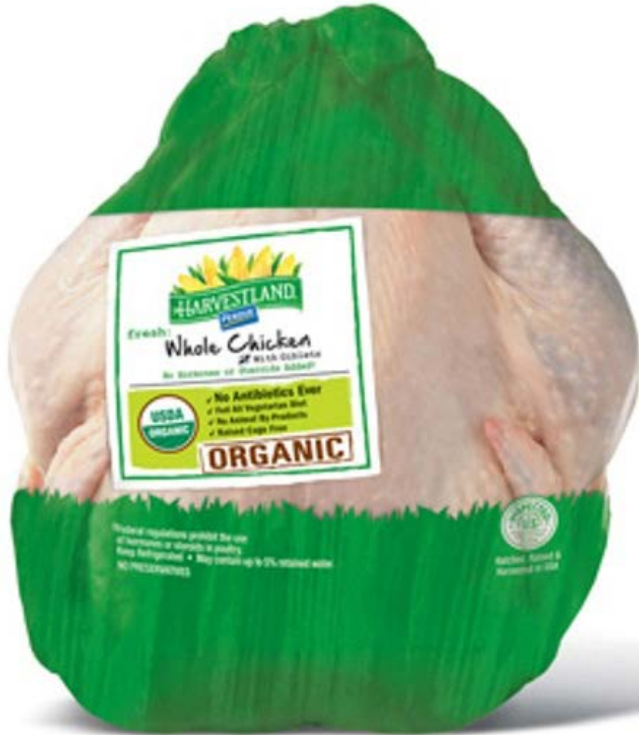
Whole Chicken Code: HV68805 Packed 6 per 28.5lb case SRP: $4.29 lb