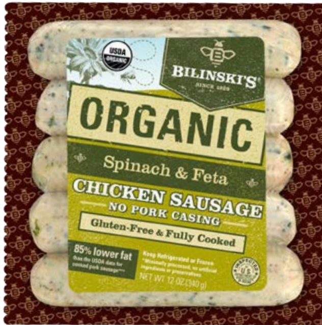
Spinach and Feta Chicken Sausage Code: BI7695 Packed 8 / 12oz UPC: 0-71728-07100-9 SRP: $7.99 ea