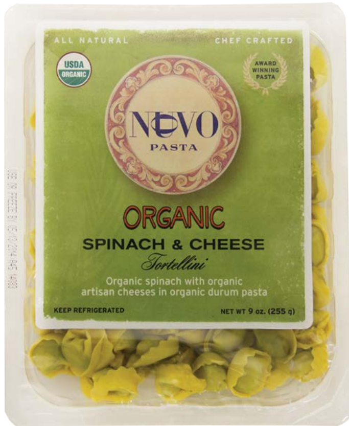
Spinach and Cheese Totellini Code: NO2519 Packed 6 / 9oz UPC: 0-80051-25193-4 SRP: $5.99 ea