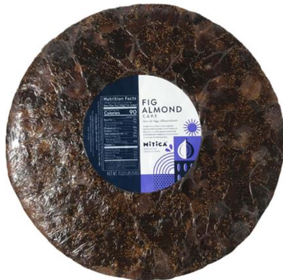
Fig Almond Cake

A complex, full-flavored, buttery Manchego aged a minimum of 14 months. The cheese comes in an elegant wooden crate. It is made by the Corcuera family, and like all of their Manchegos, from young to reserva, the standout characteristic of the cheese is the wonderful butteriness and well-rounded flavor of the sheep's milk. We have worked with Quesos Corcuera for over 20 years, and their company spans three generations of the Corcuera family.