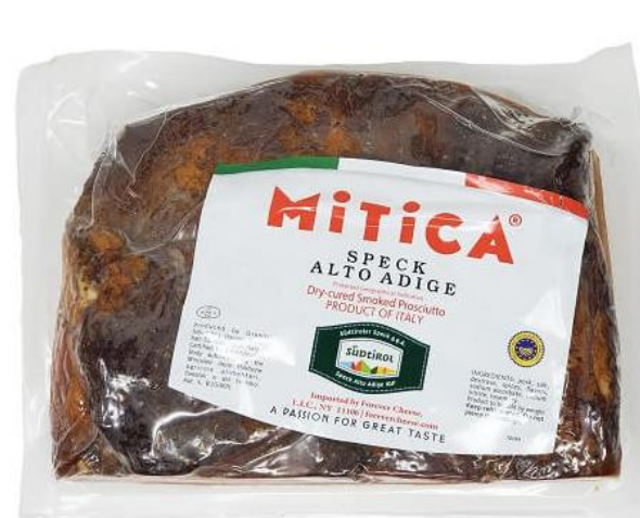
Imported Speck Alto Adige Dry Cured Smoked Prosciutto Imported from Italy Packed 1 / 12lb Porky order code FV5662

Paleta is the meat from the shoulder (the front leg) of the Ibérico pig. The deep red dry-cured meat is marbled throughout with fat. Smaller than jamón (the back leg), it needs less time for aging, a minimum of 18 months. The meat is intensely flavorful and well balanced with a mix of savory and sweet. The rich, buttery fat melts in your mouth.