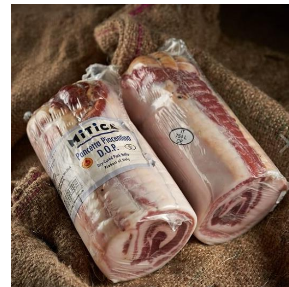
Imported Pancetta Piacentina Imported from Italy Packed 2 / 2kg Porky order code FV5663

Speck Alto Adige IGP is a cured ham that is lightly smoked. Its appearance, fragrance, and flavor make it instantly recognizable as authentic Speck manufactured with a traditional processing method, passed down through generations and protected by the European Union. While only 2 producers are approved for the states, we want to make the product the best it can be. Forever Cheese works with this producer to age the ham 6 months instead of the traditional 90 days.