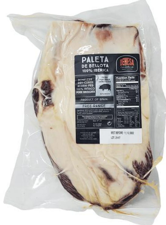
Paleta De Bellota 100% IBERICA Acorn Fed Dry Cured Pork Shoulder Imported from Spain Packed 1 / 5lb Porky order code FV5666

Jamón Serrano means mountain cured ham and is an integral part of the food culture of Spain. It differs from Italian prosciutto in that it is dry-aged at a higher temperature without lard, resulting in a lower water content and slightly drier texture that concentrates its flavors. We select the best hams made by our producer, a 3rd generation family owned and operated company. Fresh hams are buried for 10 days in Mediterranean sea salt before being moved to aging rooms for 17 months. No shortcuts are used to accelerate the process, resulting in a superior Serrano that is unctuous and full-flavored.