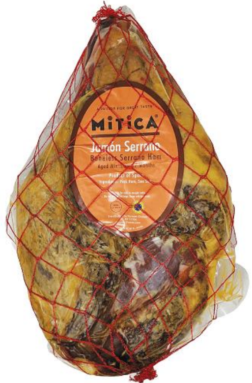
Boneless Jamon Serrano DUROC breed Imported from Spain Packed 1 / 12lb Porky order code FV5631

Jamón Serrano means mountain cured ham and is an integral part of the food culture of Spain. It differs from Italian prosciutto in that it is dry-aged at a higher temperature without lard, resulting in a lower water content and slightly drier texture that concentrates its flavors. We select the best hams made by our producer, a 3rd generation family owned and operated company. Fresh hams are buried for 10 days in Mediterranean sea salt before being moved to aging rooms for 17 months. No shortcuts are used to accelerate the process, resulting in a superior Serrano that is unctuous and full-flavored.