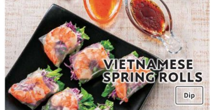
VIETNAMESE SPRING ROLLS