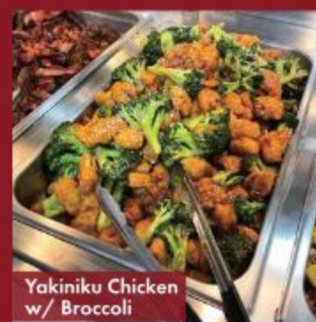
Yakiniku Chicken w/ Broccoli